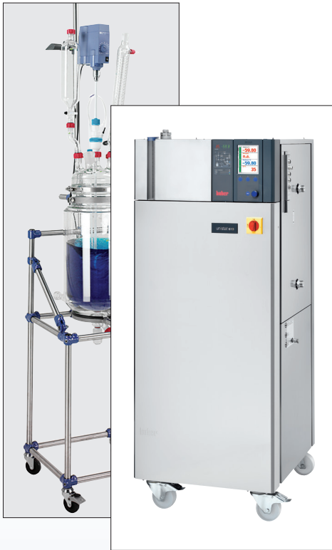
Figure 1: Exothermic reaction of 50 W